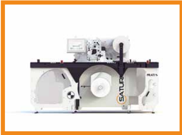
HIGH-SPEED SLITTER INSPECTION REWINDER

Now with FUTURA technology, Saturn is immediately upgradable in quick simple steps. Instant upgrades include: